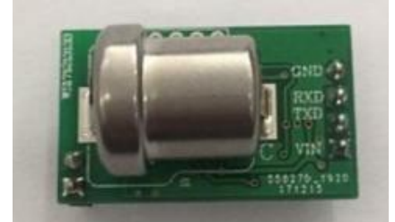
GGEHP11-D511 Country of origin: china

COE(electro chemical type) sensor is a general-purpose and miniaturization electrochemical CO gas detection module. It utilizes electrochemical principle to detect CO in air which makes the module with high selectivity and stability. It is a combination of mature electro-chemical detection principle and sophisticated circuit design.